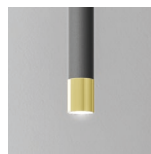
11 anthracite grey wrinkled - final polished gold