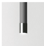
10 anthracite grey wrinkled - final black polished nickel