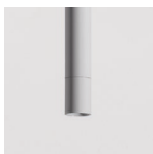
07 wrinkled white RAL 9016