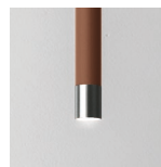
12 rust brown wrinkled final black polished nickel